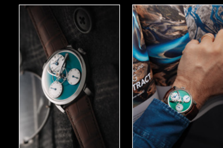
LM SE GREEN IN SITU 01