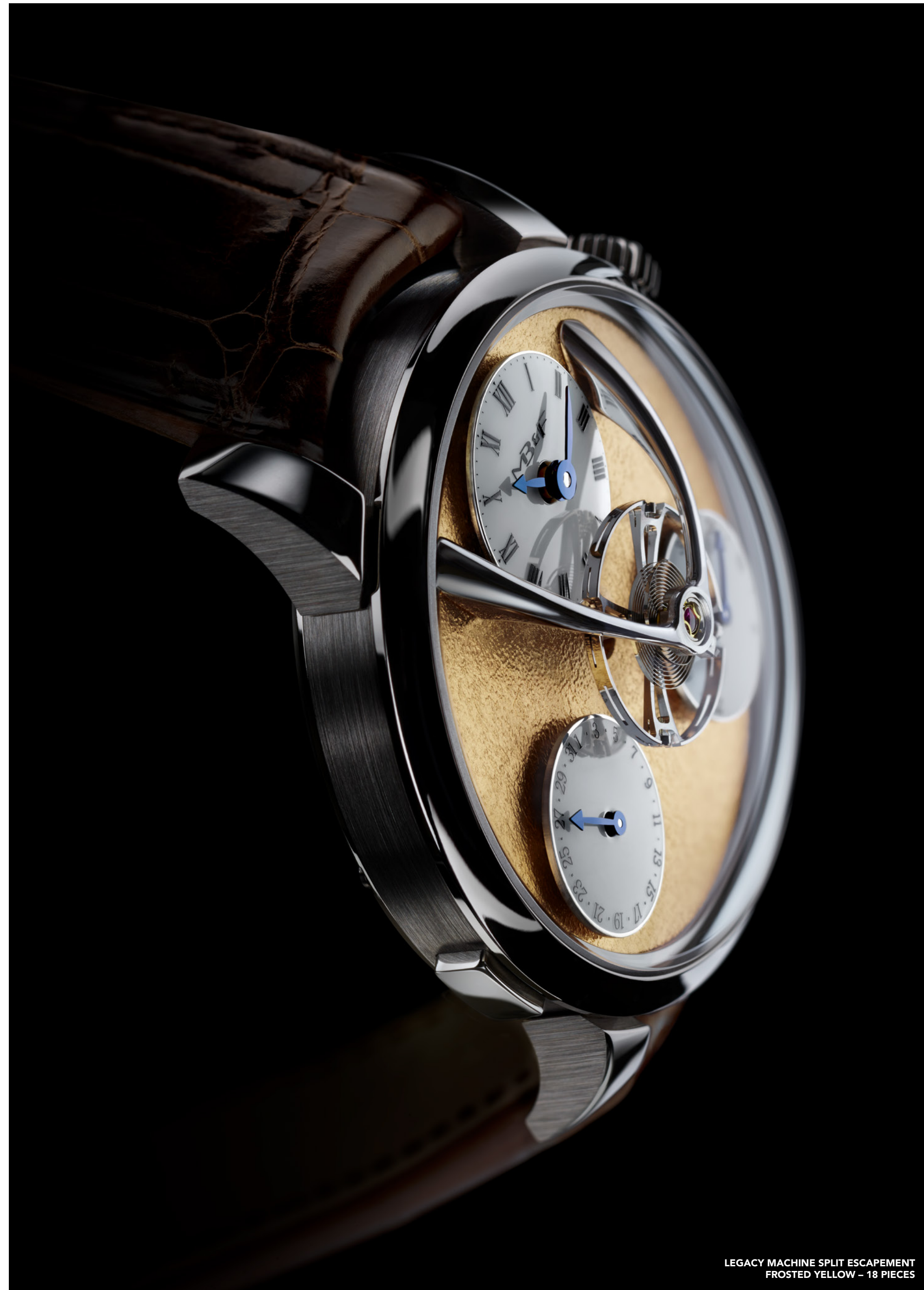
LEGACY MACHINE SPLIT ESCAPEMENT FROSTED YELLOW - 18 PIECES