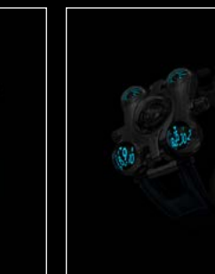
HM6 FINAL EDITION FRONT – NIGHT