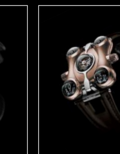
HM6 RT FRONT