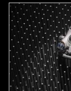
HM6 FINAL EDITION LIVE SHOT