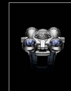
HM6 FINAL EDITION FACE