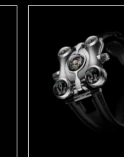
HM6 TI FRONT