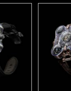
HM6 SV RED FRONT