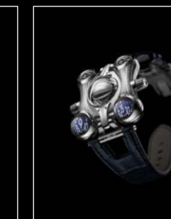
HM6 FINAL EDITION FRONT – SHIELD