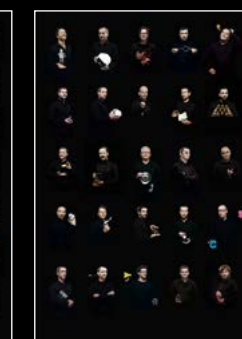
HM6 SERIES FRIENDS LANDSCAPE