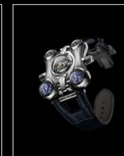
HM6 FINAL EDITION FRONT