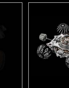
HM6 SERIE ENGINE 01