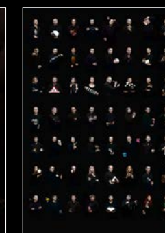
HM6 SERIES FRIENDS PORTRAIT