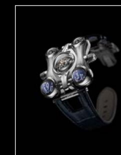
HM6 FE FRONT