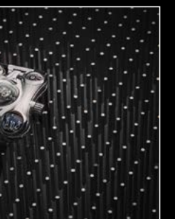
HM6 FINAL EDITION WRIST SHOT