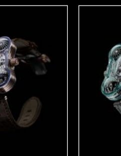
HM6 ALIEN NATION FRONT