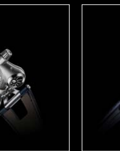
HM6 FINAL EDITION PROFILE