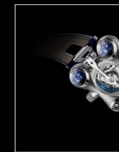
HM6 FINAL EDITION BACK