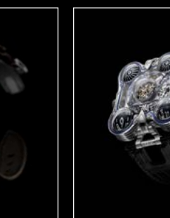
HM6 SV PLATINUM FRONT