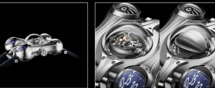
HM6 FINAL EDITION CLOSE UP TOURBILLON