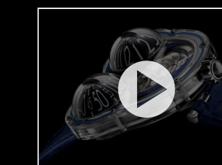
HM3 FROG X FRIENDS PORTRAIT