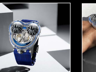
HM3 FROG X LIFESTYLE BLUE