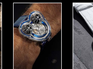
HM3 FROG X WRISTSHOT BLUE