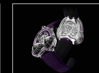
HM3 FROG X PURPLE