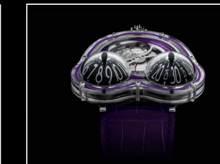
HM3 FROG X FACE PURPLE