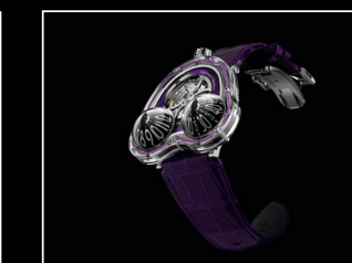
HM3 FROG X FRONT PURPLE