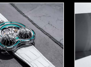
HM3 FROG X LIFESTYLE TURQUOISE