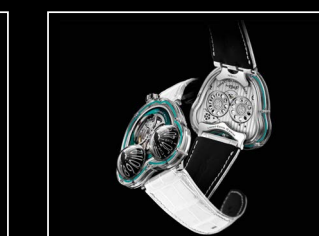
HM3 FROG X TURQUOISE