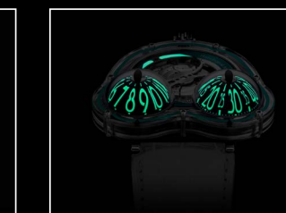
HM3 FROG X NIGHT TURQUOISE