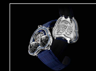
HM3 FROG X BLUE