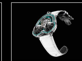
HM3 FROG X FRONT TURQUOISE