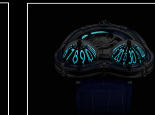
HM3 FROG X NIGHT BLUE