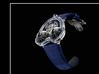
HM3 FROG X FRONT BLUE