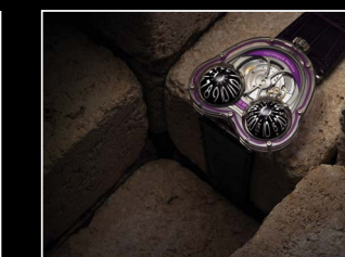
HM3 FROG X LIFESTYLE PURPLE