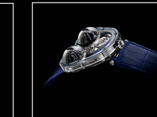
HM3 FROG X PROFILE BLUE