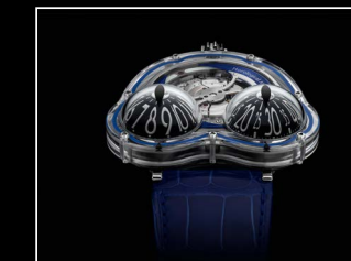
HM3 FROG X FACE BLUE