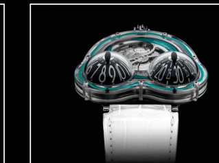
HM3 FROG X FACE TURQUOISE