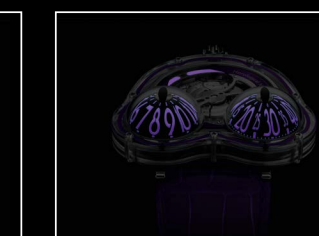
HM3 FROG X NIGHT PURPLE