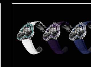
HM3 FROG X COLLECTION BLACK BACKGROUND