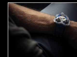
HM3 FROG X WRISTSHOT BLUE