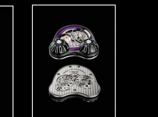
HM3 FROG X MOVEMENT PURPLE