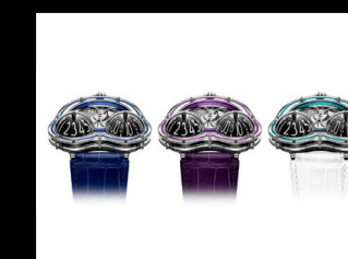
HM3 FROG X COLLECTION WHITE BACKGROUND